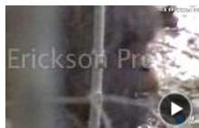
New video suggests 'Bigfoot' might really exist Oct 3, 2013