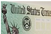
Homeowners Are In For A Big Surprise... Smart Life Weekly