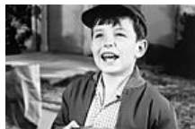
Famous Child Stars of '50s, '60s, '70s Wher... AARP