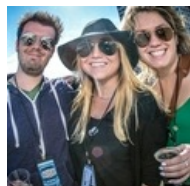
Hockeytown BrewHaH Oktoberfest