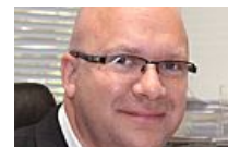
Pastor Mocked for His 'Biblical Money Cod...' Moneynews