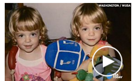
Father kills twin daughters in bitter