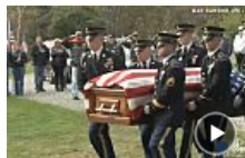
Soldier laid to rest 62 years after death Oct 6, 2013