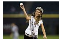
Best sports photos: Sept. 17