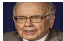
Warren Buffett Slams Obamacare Mandate Money Morning