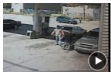
Police video: Man, 64, beaten senseless at D... Sep 24, 2013