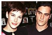
14 Famous Couples Time Forgot (But We ... Refinery29